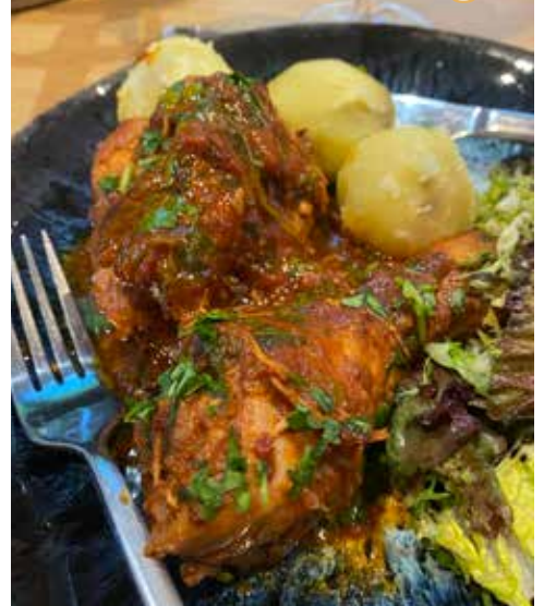
Chicken sautéed in vinegar

This is a simple, quick and economical recipe that gives supermarket chickens some taste: it sounds much posher if it's given its French name of